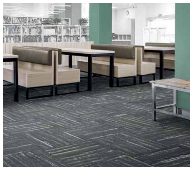
TROUBADOUR™ 4TOT5, PURE PASSAGE 400331, 24 IN X 24 IN - QUARTER TURN

ASHA recommends that background noise and reverberation be considered when designing spaces for learning. Simple ways to make a classroom quieter include adding soft materials such as carpet or rugs on the floor, and felt or cork on the walls, to absorb sound and dampen noise.