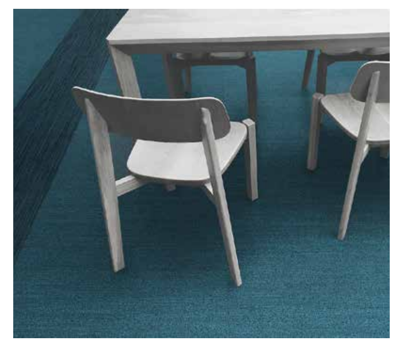
COLOR CORE™ 4EOTO, SWIM 402552, 18 IN X 36 IN - BRICK SHAPESHIFTER™ 4SET4, PARTICLE 400034, 18 IN X 36 IN

ASHA recommends that background noise and reverberation be considered when designing spaces for learning. Simple ways to make a classroom quieter include adding soft materials such as carpet or rugs on the floor, and felt or cork on the walls, to absorb sound and dampen noise.