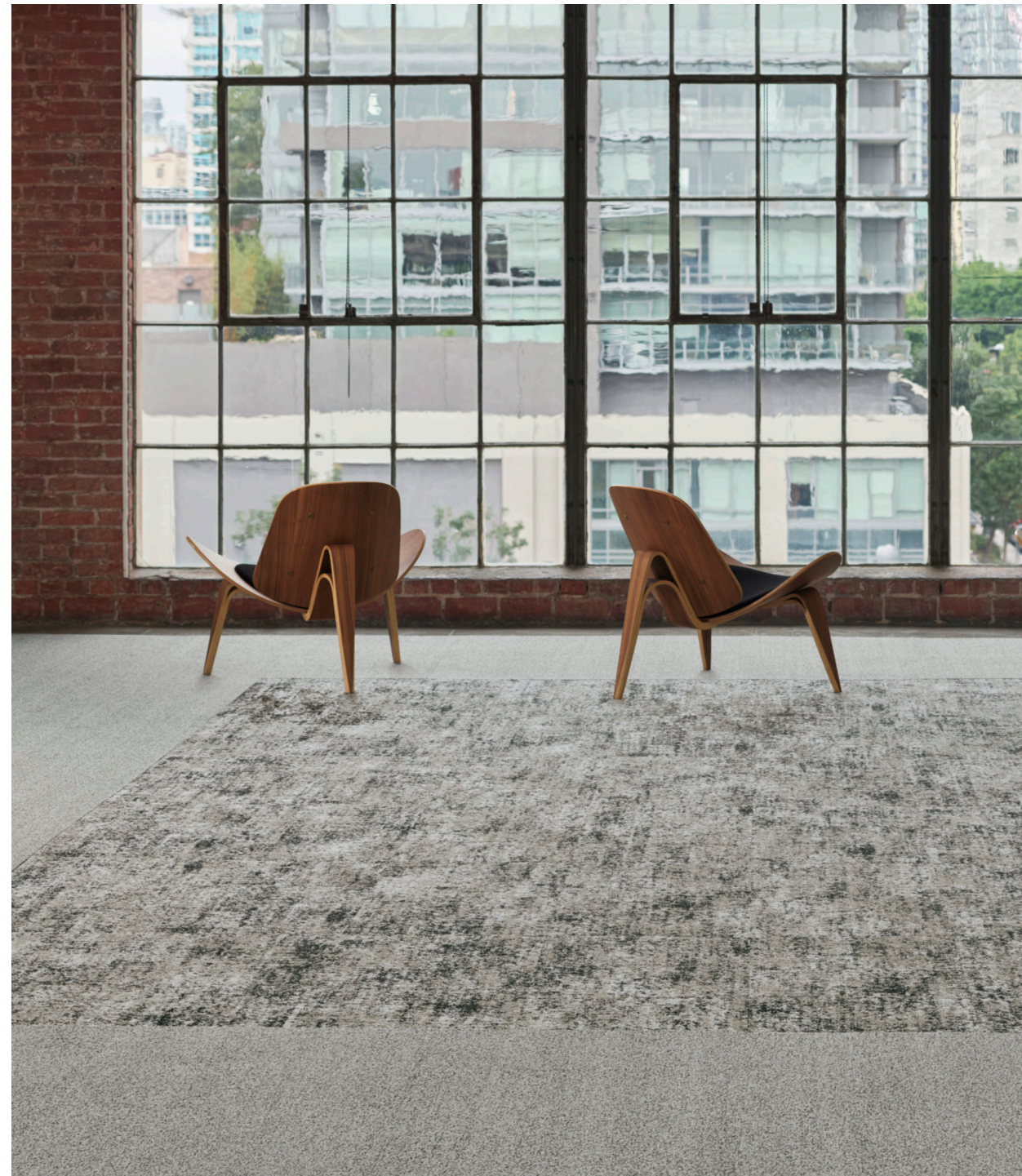
STRICTLY BUSINESS™ 8YB24, FRESCO 900908 - MONOLITHIC, LUXFELT CUSHION TILE (BORDER) COURSE OF ACTION™ 8RBT5, STUCCO 900108 - MONOLITHIC, LUXFELT CUSHION TILE (INSET)

LuxFelt Cushion Tile is tailor-made with the Bentley customer in mind. Combining the best benefits of cushion, like appearance retention and ambient comfort, LuxFelt's high recycled content and PVC-free composition can easily be recycled.